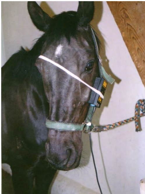
Picture 3, Horse with 8x 10 watt impulse laser shower at the molar teeth. The laser probe is fixed with a bandage at the halter and head.

The second molar of the upper jaw is known, to disturb directly at the point LU 1, the Muo point of the Lung meridian. The sinus maxillaris and the located point on the first maxillary tooth were treated using a laser area probe (8 x 10Watts impulse- diodes) for two minutes (picture 3).