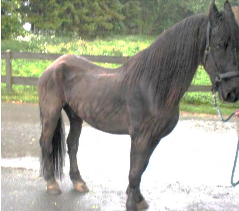
Picture 4 - 27 year-old Friesian gelding with extreme severity of the ECS before laser acupuncture

had previously been treated for more than 1 year with different antibiotic cocktails. The patient was examined with the techniques of Pulse Controlled Laser Acupuncture Concept (PCLAC) or the RAC controlled acupuncture. How profound and complex this disease was, was discovered acupuncture diagnosis. In addition to the kidney, the adrenal gland, the liver, the pancreas and, in particular, the master control system, the pituitary gland were involved in the overall disease. The triggering basic problem was the destructive inflammation of the 4th premolar (P4, disturbs on acupuncture point