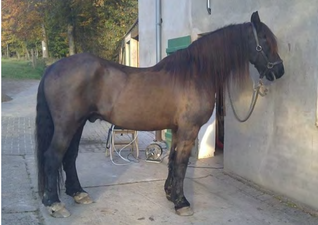
Picture 5 - Same horse 10 weeks later after laser acupuncture

Thereafter, the same treatment was continued for 8 weeks at home by the owner. Then the horse had completely recovered. Teeth and sinusitis were cured, skin was back to normal, the coat was short and glossy, the muscles had gained on healthy amount, so that the back showed no more lordosis (picture 5) and the horse could be ridden again despite its advanced age.