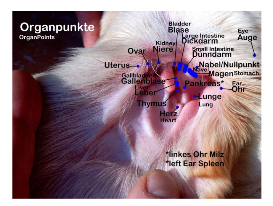
Figure 2 Ear Chard of the Organ Points