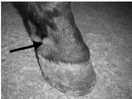
Scar in HT 9 as a cause of vegetative deregulation of the heart

A veterinary acupuncture colleague came to me with his horse because of long standing therapy-resistant very poor performance. The horse couldn’t trot more than 20 m and was not able to gallop because it was too weak. The horse had been examined and treated in several Veterinary Clinics. They found several different western diagnoses and several different treatments had been applied to this horse. Also a former acupuncture treatment done by her owner had been not successful. She had a very strong holosystolic heart noise with point of intensity over the aortic cardiac valve. There were many extra-systolic heart beats which did not disappear after a short period of work. So this horse had vegetative heart function disease. With the help of the controlled ear acupuncture I found that there must be a disturbing focus in the left front hoof region.