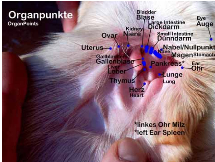
Figure 2: Ear Chart of the Organ Points