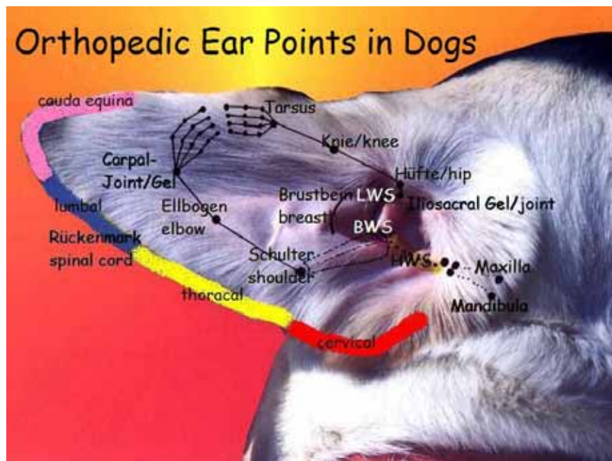
Figure 1: Ear Chart of the Joint and Vertebral Points; HWS= neck vertebrae, BWS= thoracic vertebrae, LWS= lumbar vertebrae.

The RAC/VAS Rebounds at the ear were to be found very exactly and clearly. A complete correspondence of the determined ear locations could be seen.